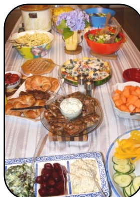
Lots of food brought to party instead of the boat