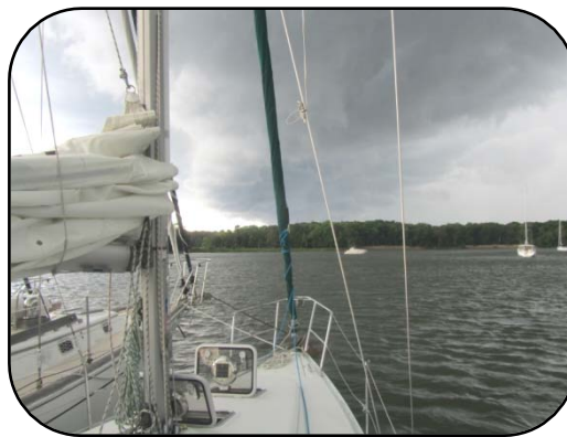
Incoming storm