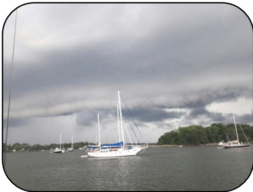
Approaching Storm